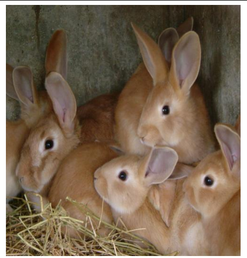
Our future:Rabbit-hutch Rotherhithe

The deluge of development plans all lodged with Southwark Council Planning Department in the last few weeks has sparked protests that the Council planners and Big Business property developers have purposefully timed this onslaught to leave ordinary Rotherhithe residents reeling in a sea of complex planning details.